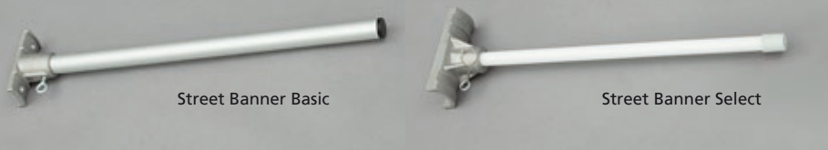
Street Banner Basic